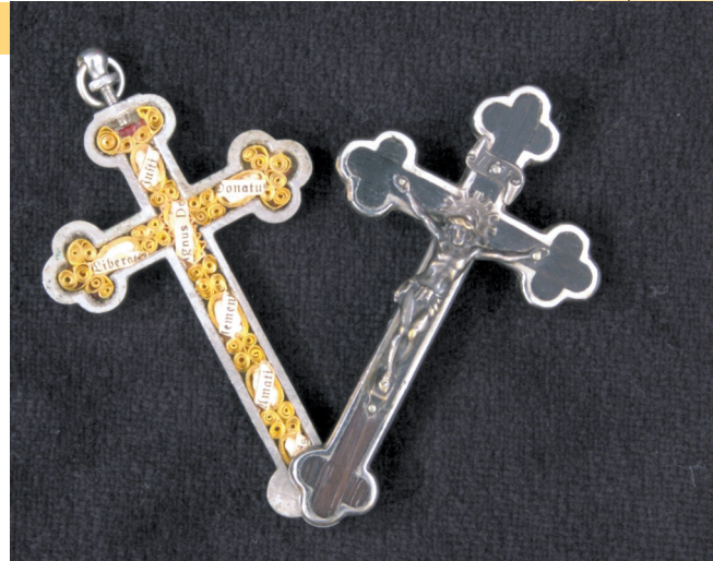
RELIQUARY CROSS WITH SIX RELICS AND ONE AGNUS DEI.

With the advent of printing, and especially movable type in the mid-fifteenth century, the mass production of books opened up reading to a broader population and allowed devotees to experience religion on a more personal and immediate level. Printers first sought to reproduce the wonder and majesty of the handwritten manuscript. Evidence of this can be found in the first book printed on movable type, the Gutenberg Bible, which references the ornate first initials of manuscripts and the delicate hand of medieval scribes. A facsimile edition of the famous bible is a part of the Sam Woods Rare Book collection and on display.