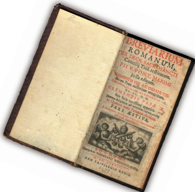
ROMAN BREVIARY, 1578.