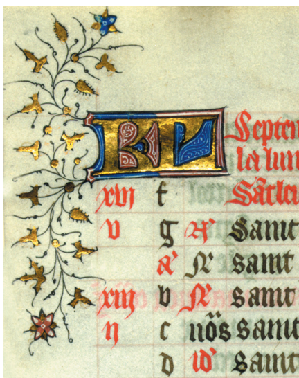
“CALENDAR” OF SAINT’S FEAST’S DAYS WITH RUBRICATED INITIAL LETTERS. FRENCH BOOK OF HOURS, CIRCA 1430.

Artifacts reveals how the history of the book in the West ties in to the religious efforts of monks, priests, nuns and other individuals who practiced and perpetuated Christianity through the written word. Micro-minuscule text on manuscript leaves dating back to 1250 reveals the diligent work of repentant monks hoping to lessen their stay in purgatory through careful hand copying. Another manuscript leaf, a rubricated calendar from a 1430 Book of Hours, still dazzles hundreds of years after its creation with metallics and blues. A mammoth, handwritten Spanish antiphonal preserves the recitations of 15th-century monks on fine animal skin, or vellum.