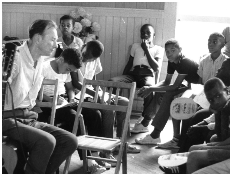
LEGENDARY FOLK SINGER AND SOCIAL ACTIVIST PETE SEEGER MEETS WITH STUDENTS IN A FREEDOM SCHOOL CLASS AT MT. ZION BAPTIST CHURCH IN HATTIESBURG ON AUGUST 4, 1964.