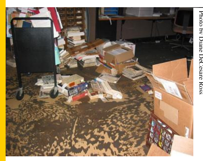
Flood damage at the Gulf Coast Library

Overall, the facility fared well and it appears to have little if any structural damage. The first floor of