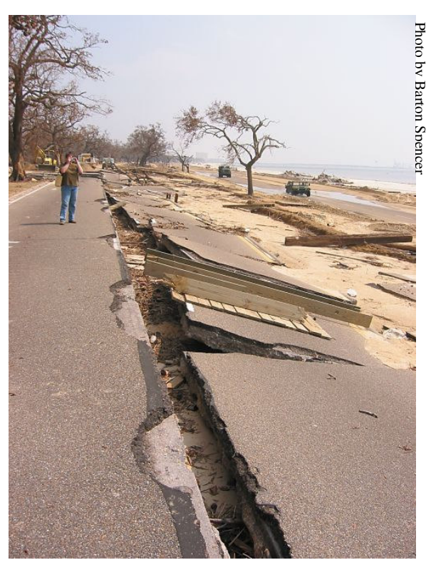
DRAT member surveys coast damage after Katrina

The DRAT spends most of its time working to prevent damage to the libraries and making plans to respond to disasters when they occur. Members regularly search out potential threats to the collections. They look for possible