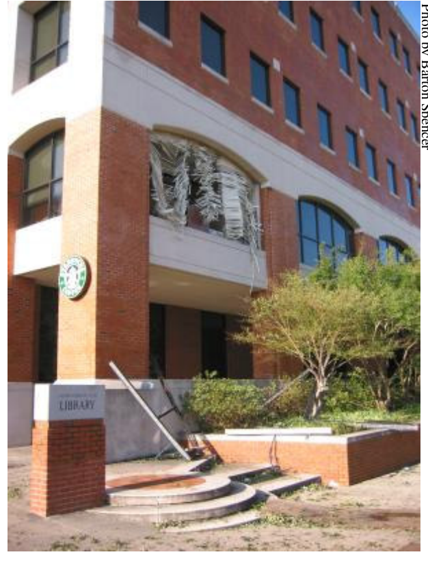
The Halon fire suppression system has been damaged and rendered inoperable, according to the University's Safety Officer. Power and HVAC were restored September 1.

While the facility sustained no significant damage from rain or wind, there were some leaks around windows on the third floor work area where carpet was damp.