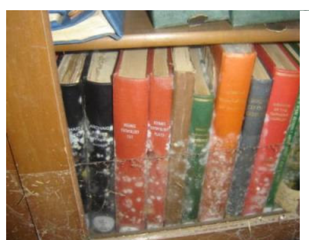
Mold and mildew damage at Gunter Library

items on the bottom shelves that were ruined in both the main part of the library and the stacks tower. There was more mud left in this facility and BMS Catastrophe has been working on salvaging materials. Power was restored September 2 or 3, but the HVAC system was not working properly, so mold and mildew continued to grow. Three humidifiers were dispatched to the site September 14. There was more initial collection damage at Gunter Library