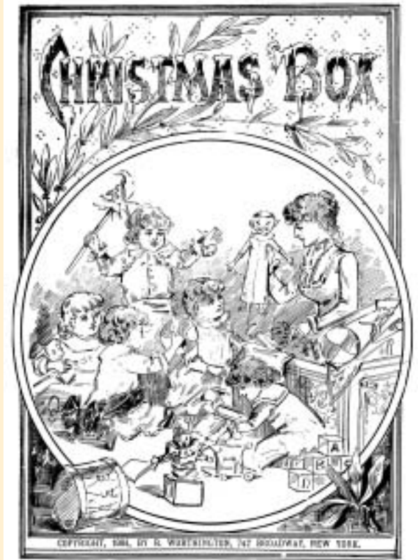
From Christmas Box in the de Grummond Children's Literature Collection

The Holiday Book Fair will be held on Sunday, December 7, and Monday, December 8. This year, the Book Fair will be held on the second floor of Cook Library and we will have live Christmas music for your enjoyment.